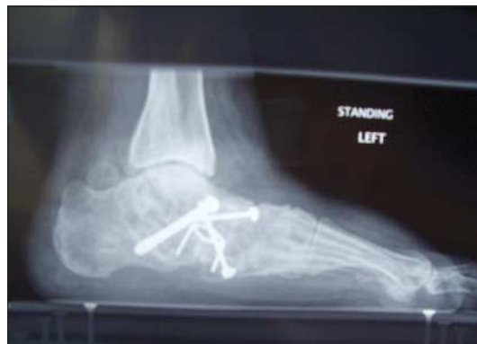
Fig 5 Stage III tibialis posterior dysfunction before and after surgery (a triple arthrodesis). (top) Preoperative film shows a plantar flexed talus (arrows point to head of talus) and loss of arch contour and height. (bottom) Postoperative film shows union and reconstitution of the arch

by the patients, most of whom are women aged 40 or older. Compliance can be a problem, especially in stages I and II. It helps to emphasise to the patients that tibialis posterior dysfunction is a progressive and chronic condition and that several fittings and a trial of several different orthoses or treatments are often needed before a tolerable treatment is found.