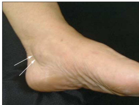
Fig 1 Arrows indicate swelling along the tibialis posterior tendon

In stage I, patients typically present with an insidious onset of vague pain in the medial foot and swelling behind the medial malleolus along the course of the tendon (fig 1). 5 Patients usually have no history of acute trauma. As the condition progresses to stage II, patients have more complaints related to loss of function and change in the shape of the foot. They report either a unilateral worsening of a pre-existing bilateral flatfoot or a newly acquired flatfoot deformity. 22 We tested survey questions and found that medial pain or swelling behind the medial malleolus together with a change in foot shape picked up 100% of patients with tibialis posterior dysfunction and had a specificity of 98% (box 2). 5 Also the patient may have a feeling of instability, a limp, a restricted walking distance, and an inability to walk on uneven surfaces. This also leads to an increased awareness of other foot pathologies, such as bunions, hallux rigidus, and metatarsalgia, which may be the reason why the patient seeks medical atten-