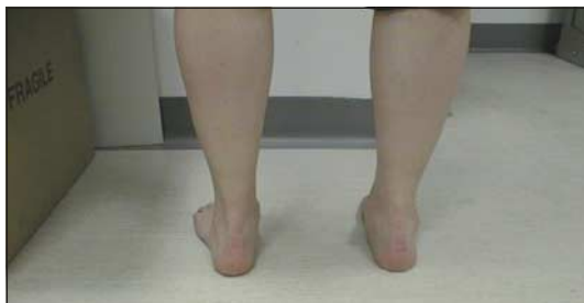
Fig 2 Left tibialis posterior dysfunction deformity is easily visible. The medial longitudinal arch is flattened. The left heel is in valgus. Also visible is the “too many toes sign,” which results from abduction of the left forefoot

Someone with a normal foot can perform a single heel rise eight to 10 times, but by stage II patients are unable (or barely able) to perform a single unsupported heel rise. Even if the patient is supported to facilitate the attempted heel rise, the heel will not invert as it normally does (fig 3). 16 In stages III and IV, in addition to the findings in stage II, the flatfoot deformity has become fixed. This is examined by grasping the heel and attempting to correct the valgus of the hindfoot (box 4).