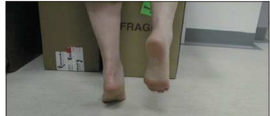
Fig 3 (top) Unsupported single heel rise on patient's good (right) side. (bottom) Attempt to perform a single heel rise on the affected left side. The patient was unable to do so unsupported but for the purpose of this photo was allowed to lean forward and support herself on the counter in front of her. The heel of the left foot has not inverted into varus