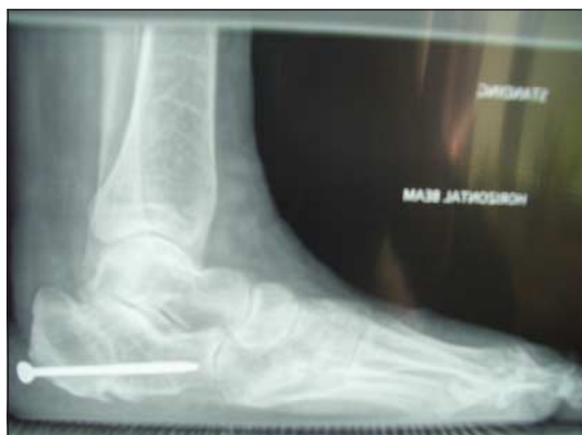
Fig 4 Before surgery (top) and five years after surgery (bottom) for a patient with stage II tibialis posterior dysfunction. The surgical reconstruction included a Cobb split tibialis anterior tendon transfer and a Rose varus calcaneal osteotomy